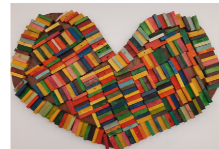
Art piece designed by Te Ara Poutama students

A reminder that we are closed for teacher only day on Friday 13 August. We recognise this can be inconvenient for families, however we are required to do this under the teachers collective agreement.